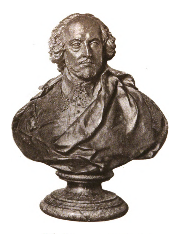
The Davenant Bust by permission of the Garrick club